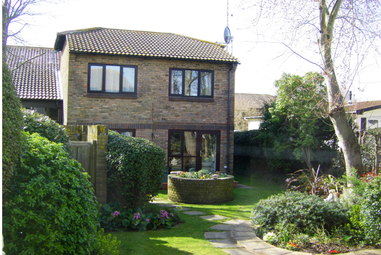
No 1 Well Lodge

For viewings please contact the Scheme Manager on 01243 267051 or Fifty5plus on 01488 668655