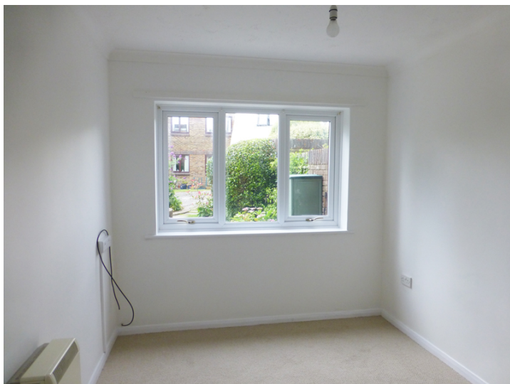
1 Well Lodge

The property is within walking distance of shops and there are also regular bus services to Chichester. Comprehensive facilities are available in Bognor Regis about a mile and a half away.